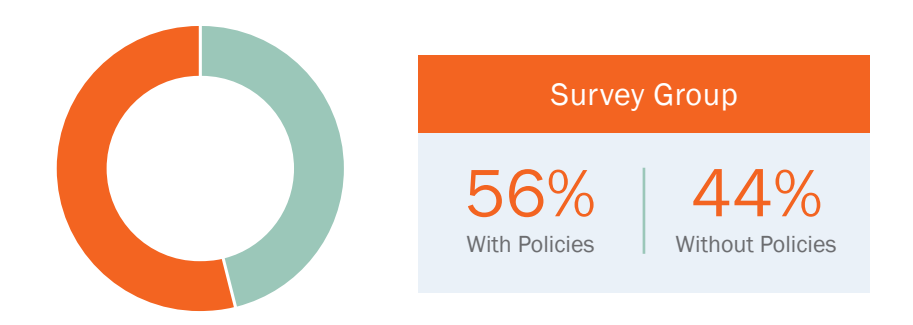
Figure 1. Prevalence of Policies

56% of the 179 issuers in our survey group have adopted formal policies addressing the representation of women on the board. This is a good example of disclosure rules driving corporate behaviour, as the vast majority of issuers who have policies appear to have adopted them between the 2014 and 2015 meeting seasons. While the rules only require disclosure regarding board policies, some issuers have gone further and adopted a policy that also addresses women's representation in senior management (either as part of the board policy, or as a standalone policy).